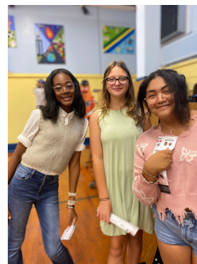
Picture Day 2022